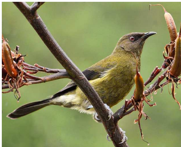
Bellbird / Korimako ( Anthornis melanura )

The -O option is available since December 31, 2013.