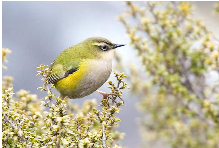
Rock Wren / Hurupounamu ( Xenicus gilviventris )