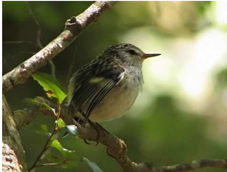
Rifleman / Titipounamo ( Acanthisitta chloris ), NZ's smallest bird