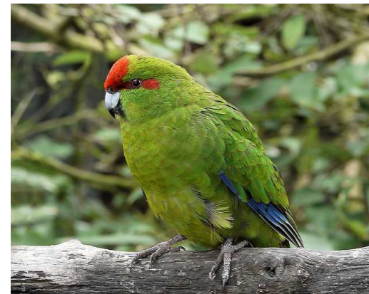
Red-crested parakeet / Kakariki (Cyanoramphus novaezelandiae)