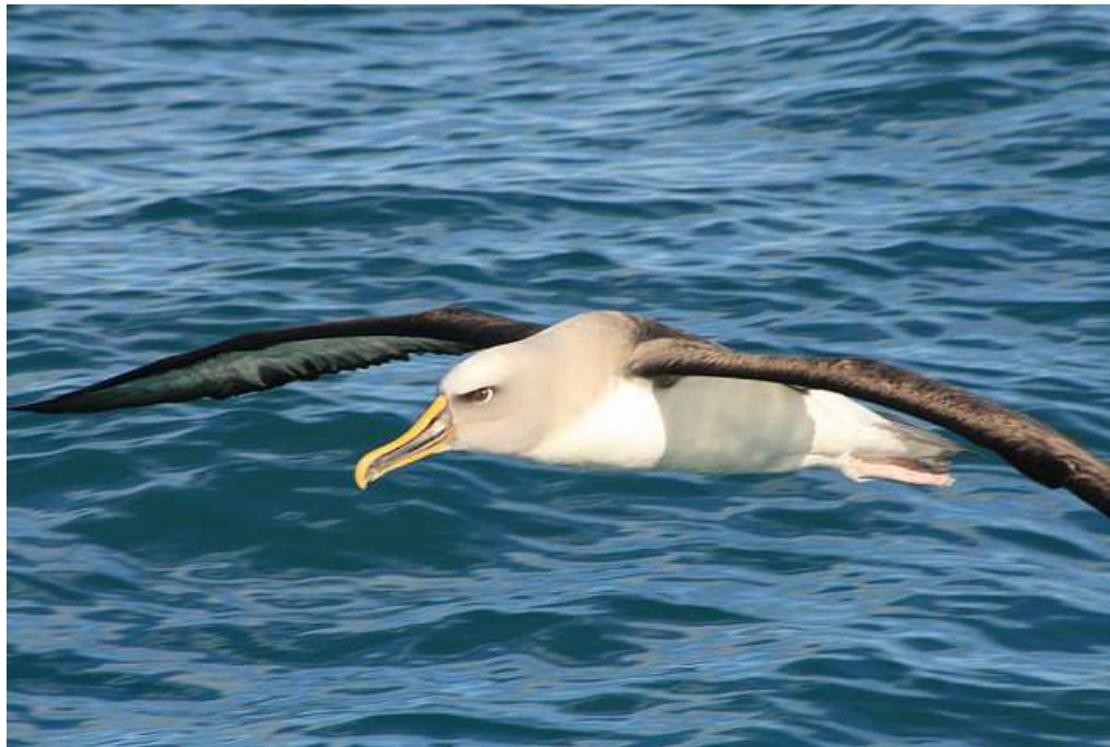
Buller's Mollymawk / Toroa-teoteo ( Thalassarche bulleri )