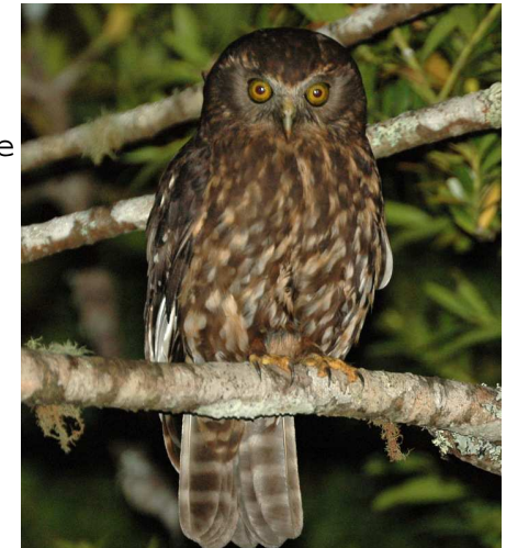
Morepork / Ruru (Ninox novaeseelandiae)

Complex search queries are working since January 4, 2014.