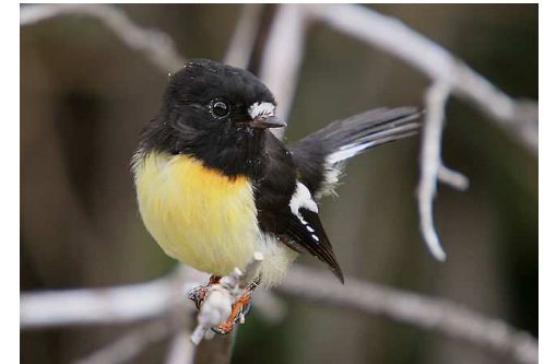
Tomtit / Miromiro ( Petroica macrocephala)