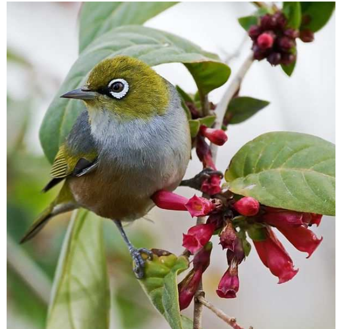
Silvereye / Tauhou ( Zosterops lateralis )