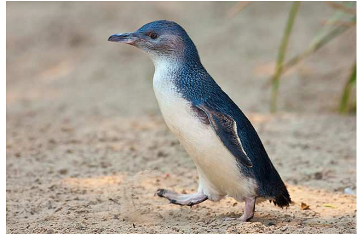
Little Blue Penguin / Korora (Eudyptula minor)