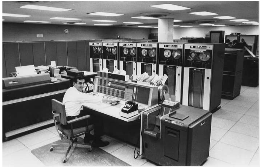
IBM 7094

Macro lines contain a period (‘.’), a macro name, and optional arguments.