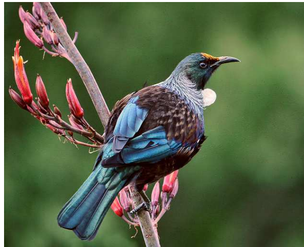
Tui ( Prothemadera novaeseelandiae )