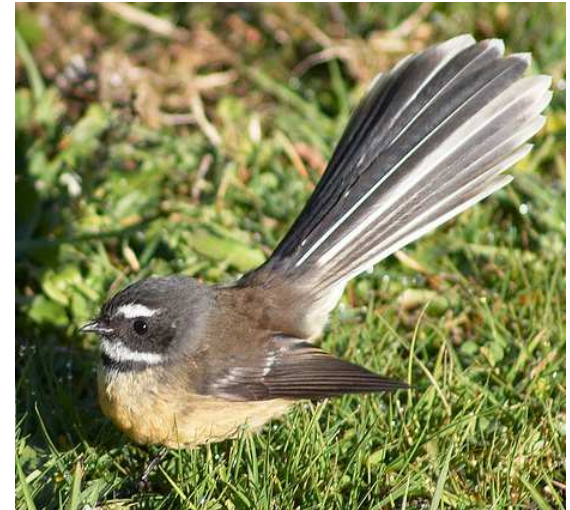
Fantail / Piwakawaka ( Rhipidura fuliginosa)

Matured considerably in addition to growing new features.