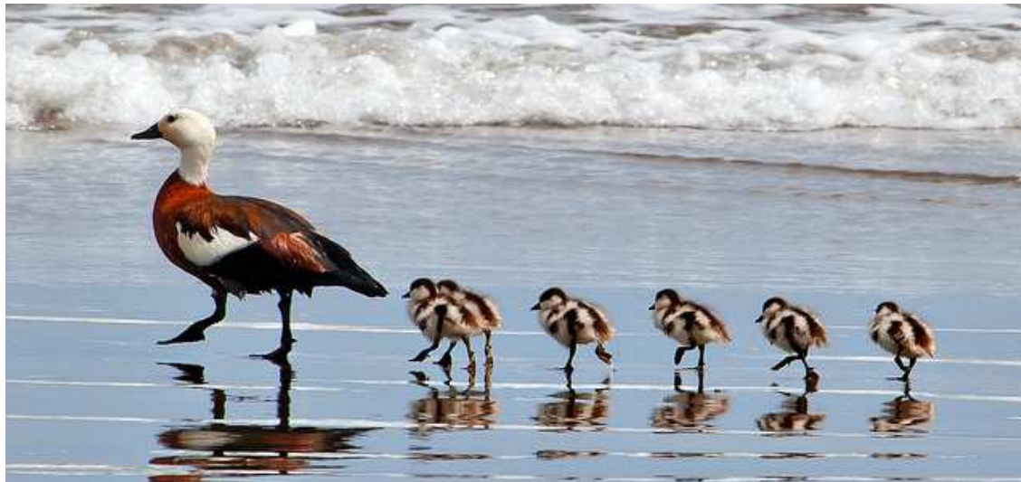
Paradise Shelduck / Putangitangi ( Tadorna variegata )