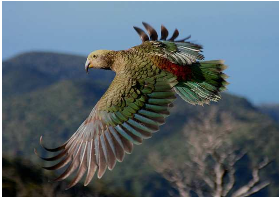
Kea juvenile ( Nestor notabilis) exploring new horizons