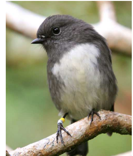
Robin / Toutouwai ( Petroica australis)