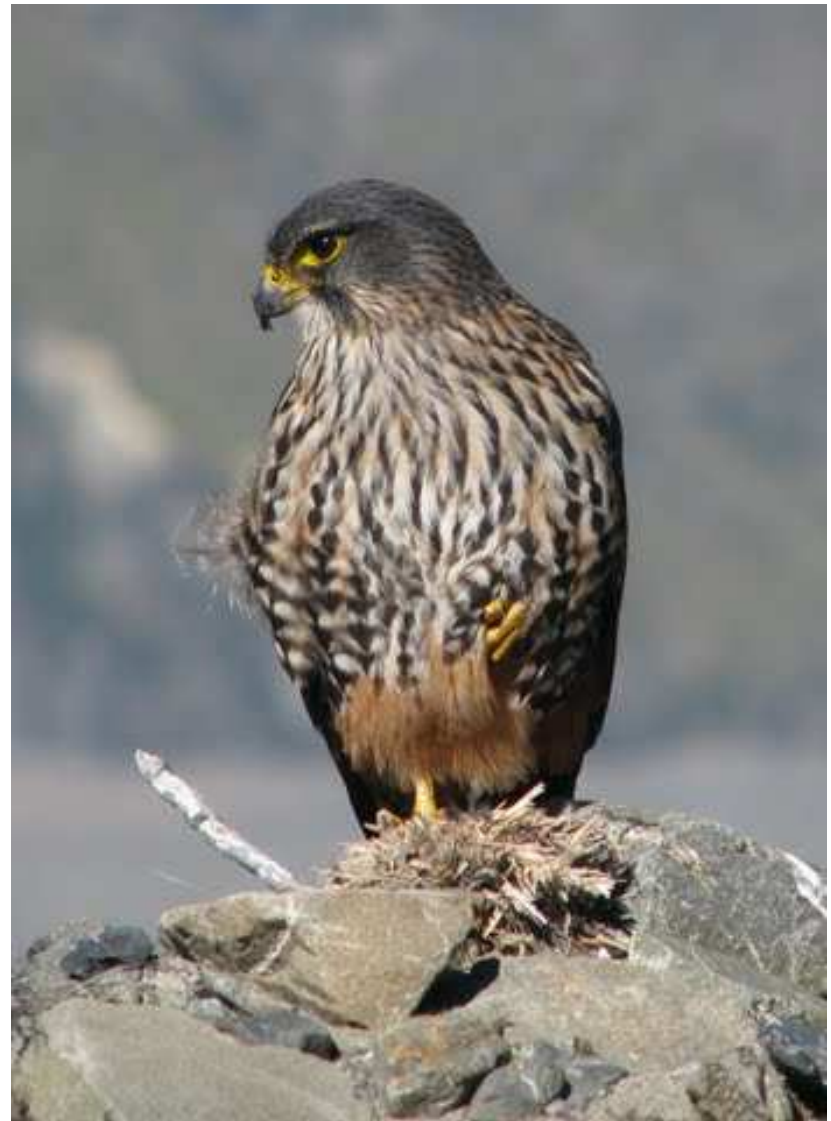
Falcon / Karearea ( Falco novaeseelandiae )