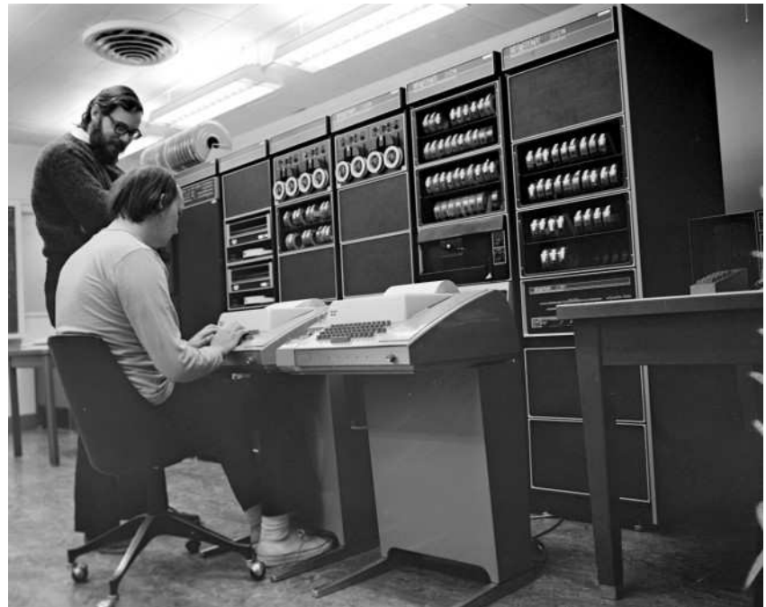
Ritchie, Thompson, PDP-11

Section headers in use since v1: NAME, SYNOPSIS, DESCRIPTION, FILES, SEE ALSO, DIAGNOSTICS, BUGS