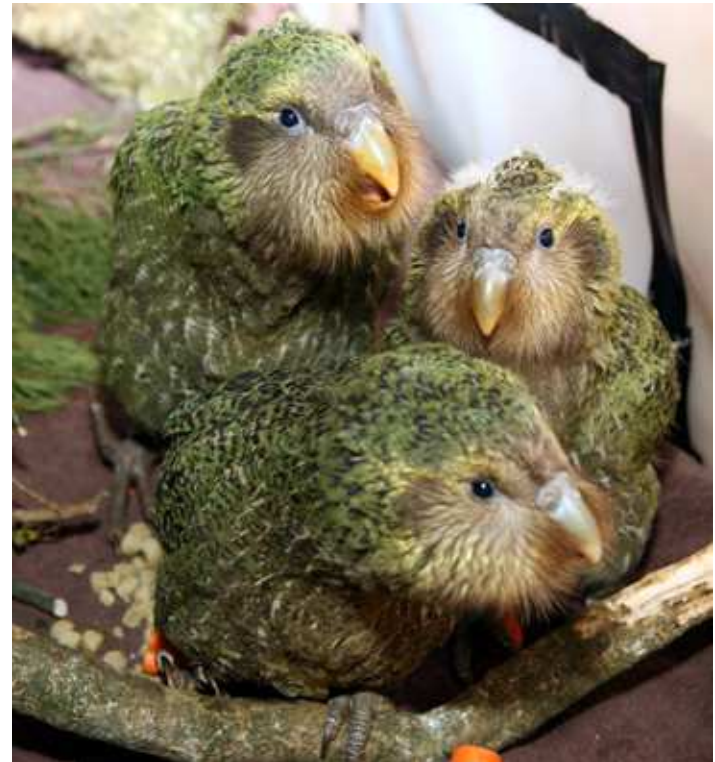
Kakapo chicks ( Strigops habroptilus )