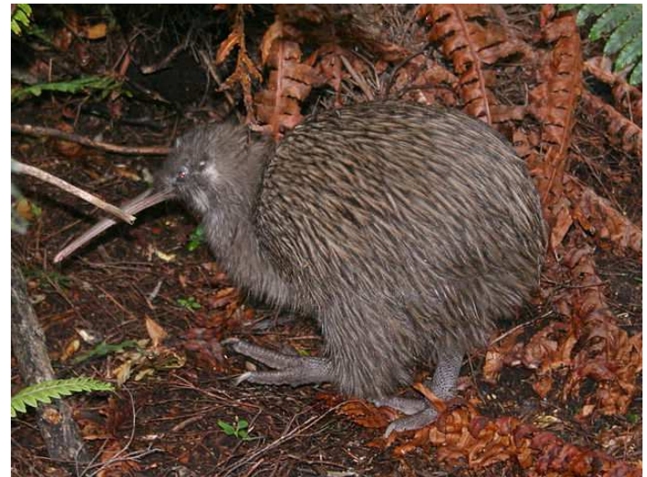
Southern Kiwi / Tokoeka ( Apteryx australis )