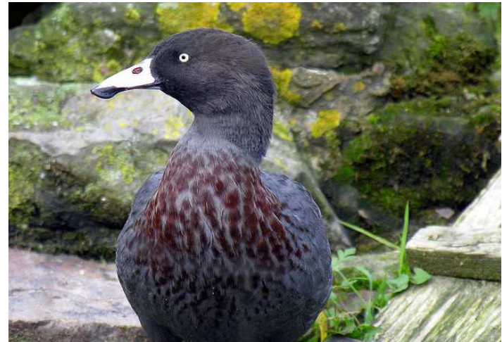
Blue Duck / Whio in Sussex, England ( Hymenolaimus malacorhynchos )

Provides packages for additional systems.